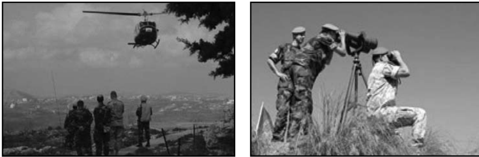
Helicopter landing at a UNTSO observation post in Kham, Lebanon, March 2003

While not specifically envisaged in the United Nations Charter, the UN pioneered military observation and supervision in 1948 with the establishment of the United Nations Truce Supervision Organization in the Middle East (UNTSO). A similar observation mission was established in India and Pakistan the same year to monitor the cease-fire over Kashmir and investigate complaints related to breach of the cease-fire by both sides. Both missions were observation missions by unarmed personnel and are still active today.