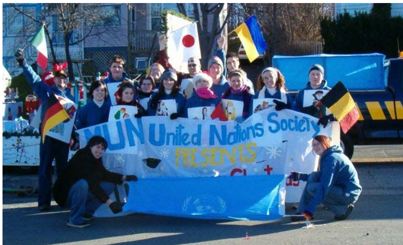
Memorial University UN Society, St. John's, NL

Vancouver, BC - Victoria, BC - Kootenay Region, BC - Calgary, AB - Edmonton, AB - Saskatoon, SK - Winnipeg, MB - Hamilton, ON - National Capital Region, ON - Quinte Region, ON - Toronto, ON - Montreal, QC - Quebec City, QC - Saguenay Region, QC - St. John's, NL